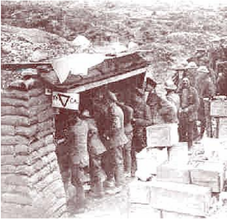
A front-line hut where the YMCA gave out food and drinks