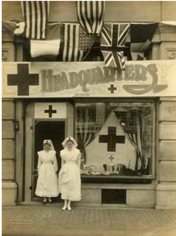
Red Cross Headquarters in Montgomery, 1918

While the soldiers were in Europe fighting, Alabamians worked very hard at home to support the troops. They joined groups like the Red Cross, YMCA, and YWCA. Alabama women formed groups to sew clothing, can food and make money for the war by selling war stamps.